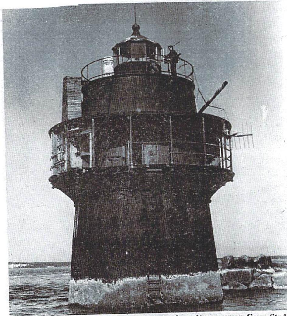
Coast Guard personnel and a representative from Congressman Gerry Studds' office inspect the upper part of deteriorating Duxbury Pier Light.